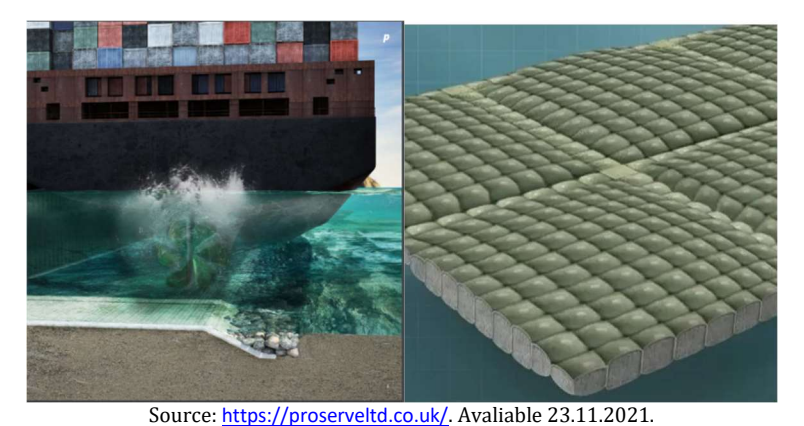
Fig. 3 - Concrete-filled fabric mattresses on harbour bottom.

Coefficient C_L is ranging from 0.50 to 0.75 [9]. Figure 3 shows concrete-filled fabric mattresses lay-up and structure design.